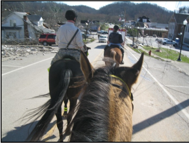
Patrolling downtown West Liberty

The variety of construction and destruction equipment we dealt with was mind boggling. We walked under a huge crane with big jaws transporting car-sized loads of debris into a dump truck from what was once a public building; the crane never stopped moving. Chainsaws were deafening, electric linemen with their specialized cranes and heavy equipment to reset poles were everywhere, along with backhoes, and a helicopter. It was hard, if not impossible, to get out of their way with the debris piled 5 feet high all along edges of the roads where they had been temporarily shoved out of the way.