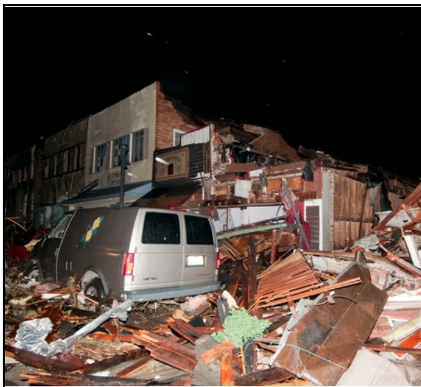
West Liberty Downtown Friday night

The Equus Survival Trust, ironically once located in West Liberty, is working closely with breeders in the area to provide the relief they need; hay, feed, halter & leads, buckets, portable stabling, fencing & eventually replacement of farm equipment.