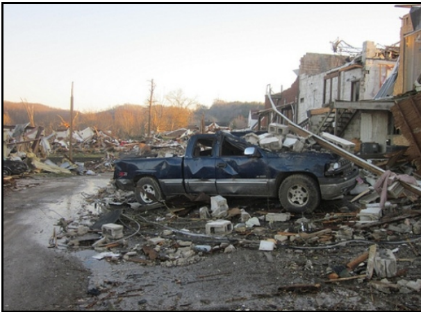
View of Downtown West Liberty in shambles Saturday morning

We lent a sympathetic ear to stunned folks who needed to vent or to desperately recount their experiences; we gently talked shell-shocked folks out of staying in their destroyed, condemned homes and instead directed them to the two shelters in town. We directed countless injured to the medics. Eight out of ten homes were either totally destroyed or marked with orange paint signifying structural damage significant enough to condemn them. Not a single commercial building was left standing. I met people out in Sunday's snows still dressed in shorts and flip flops from Friday night's 70 degree weather. The storms had destroyed or blown away all the rest of their belongings.