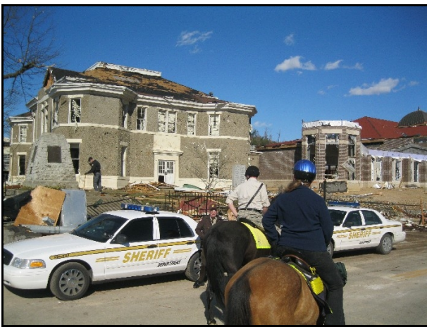
Riding past the West Liberty Judicial Center

The variety of construction and destruction equipment we dealt with was mind boggling. We walked under a huge crane with big jaws transporting car-sized loads of debris into a dump truck from what was once a public building; the crane never stopped moving. Chainsaws were deafening, electric linemen with their specialized cranes and heavy equipment to reset poles were everywhere, along with backhoes, and a helicopter. It was hard, if not impossible, to get out of their way with the debris piled 5 feet high all along edges of the roads where they had been temporarily shoved out of the way.