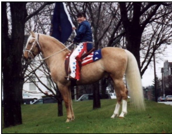
Mountain Pleasure/Appalachian Purebred Gaited Horse

The town of West Liberty, in Eastern Kentucky was one of the hardest hit; the decimated town and its people have been all over the national news. Red Cross and other human services have quickly responded. Even the Human Society has responded. But there are other casualties in this disaster.