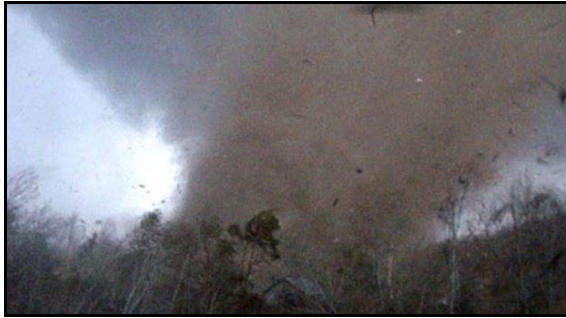
Tornado as it passes over West Liberty